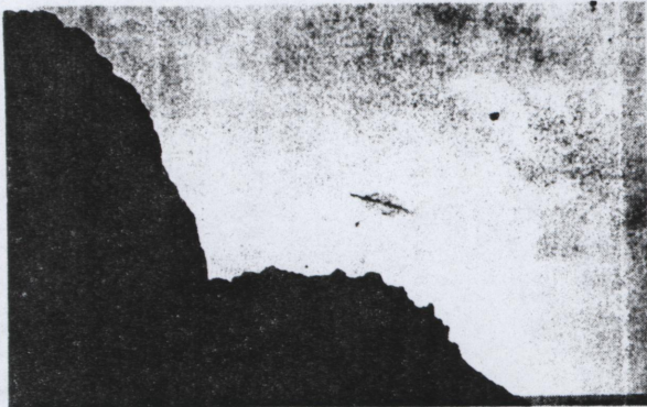
● JUST visiting? An unidentified flying object spotted off the Brazilian coast in 1958, an event which also forms part of the author's fascination.

In that year, three young children were gathered behind an olive tree when the ground began to shake.